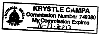
Notary Public in and for the State of Iowa