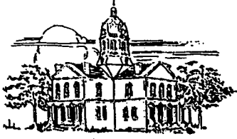
Courthouse at Winterset Madison County, Iowa Built in 1876 of native limestone.