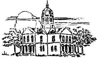
Courthouse at Winterset Madison County, Iowa Built in 1876 of native limestone.