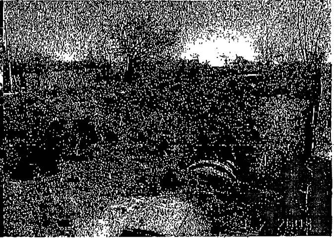
Distribution box and laterals looking south