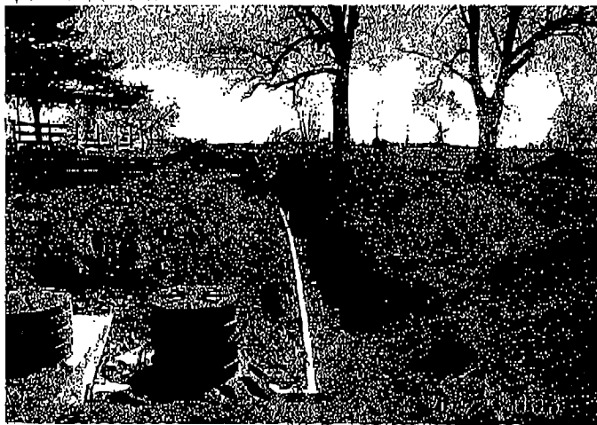
Looking south from pump tank to lateral field