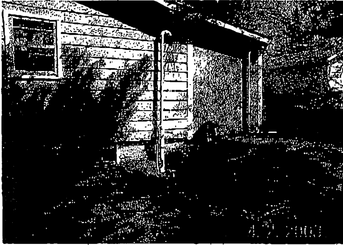
Cleanout at house