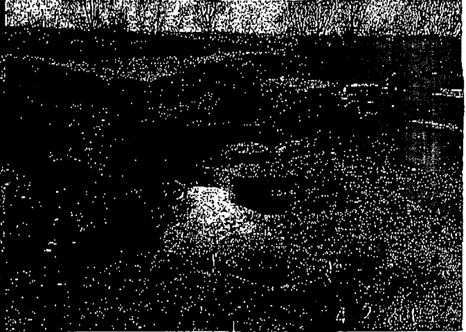
Septic tank and Pump tank looking West