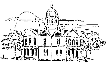
Courthouse at Winterset Madison County, Iowa Built in 1876 of native limestone.