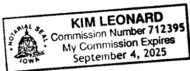
Notary Public in and for the State of Iowa